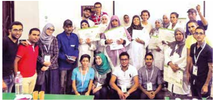
National Engineering School of Carthage, Tunisia