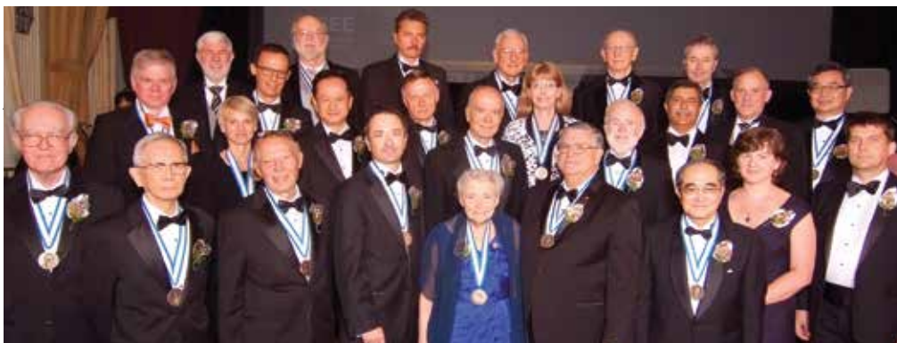
Mildred Dresselhaus (front row, centre) is the first woman to receive IEEE's highest award, the Medal of Honor.

ENGINEERS across Region 8 were among those given recognition for their achievements at the 2015 IEEE Honors Ceremony that took place on 20 June at the Waldorf Astoria Hotel in New York.