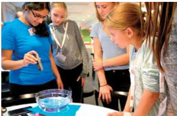
School-age girls of a variety of ages took part in the event in Sweden.