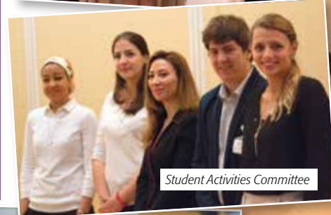
Student Activities Committee