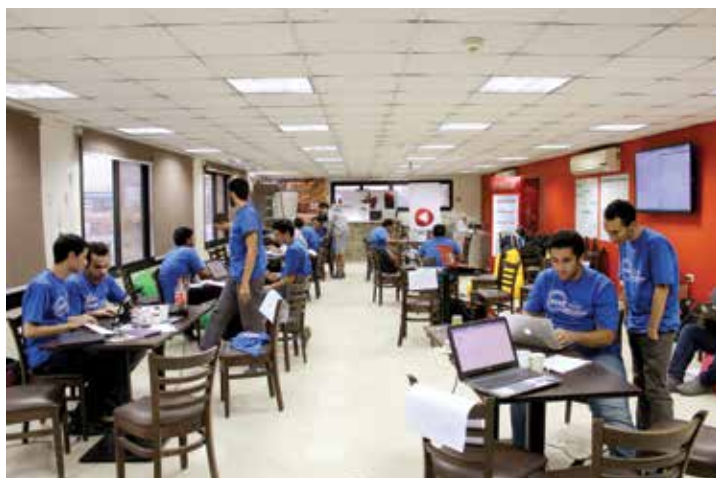
Nine Egyptian teams came through the LCW'15 initiative, three ranking among the best in the world.

For this edition of IEEEExtreme, 34 Egyptian teams registered and 28 teams participated, out of which nine were through LCW'15. Three teams from Egypt were ranked among the best 100 teams in the world. The LCW'15 closing video can be watched here: https://goo.gl/FdL2WT