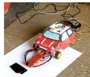
Visitors were fascinated by last year's competition prototypes.

Some 200 attended the event, also entertaining themselves by taking part in photo sessions and a number of simple games.