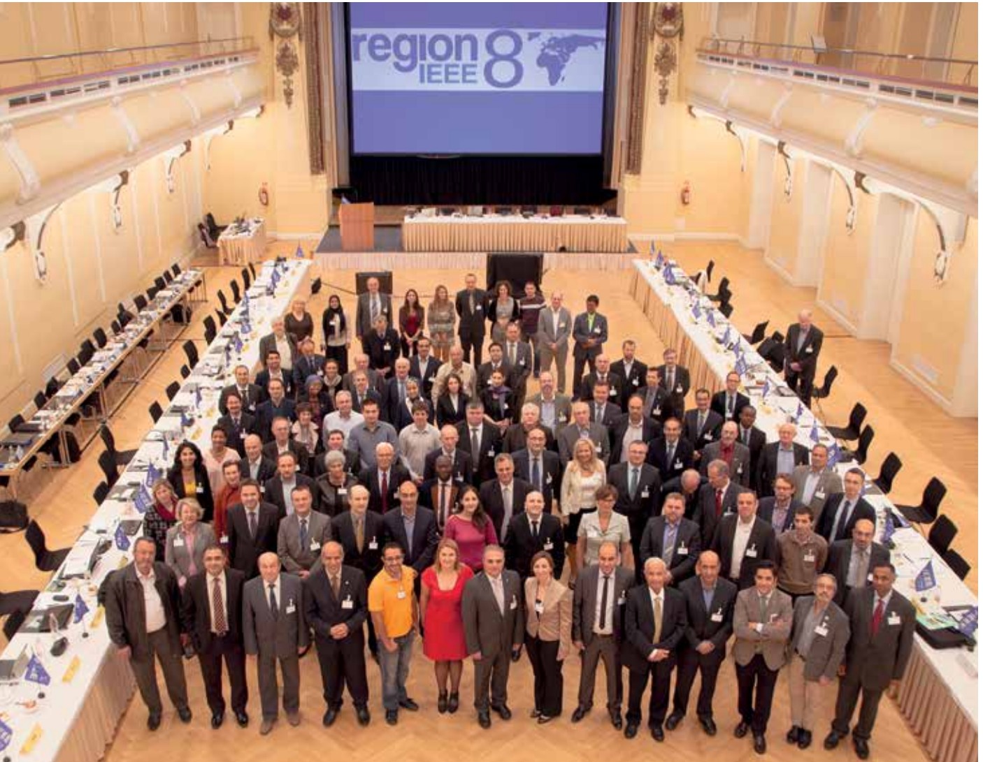
Photo gallery: highlights of the IEEE Region 8 Committee meeting in Ljubljana, Slovenia