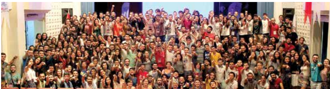
Some 280 participants attended the event in Izmir, one of the largest cities in Turkey.

IZMIR University Student Branch hosted 280 students from 42 universities at the University for the 13th annual IEEE Turkey Student and Young Professional Congress 24-28 August 2015, with the participation of many academics and speakers.