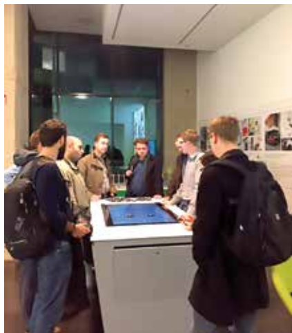
Eurf Campus is home to companies working on projects concerning sustainability and environmental protection.

A VISIT to the multi-awarded smart urban quarter in Berlin which has already fulfilled the climate targets of the German federal government for 2050 was organized by the IEEE Young Professionals Network in Berlin on 28 October 2015. It included a visit to over five hectares large Eurf Campus and to French corporation Schneider Electric.