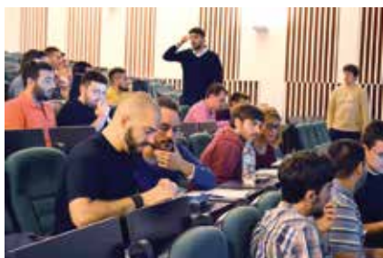
Participants had to prepare a 30-second elevator pitch for their ideas.

KEEPING up with the tradition of the Hellenic Student and Young Professional Congresses, after Patras, Greece, in 2012 and Nicosia, Cyprus, in 2013, the Aristotle University of Thessaloniki IEEE Student Branch organized the 3rd HSYP Congress from 30 October to 1 November 2015 at the Aristotle University Research Dissemination Center. Students and