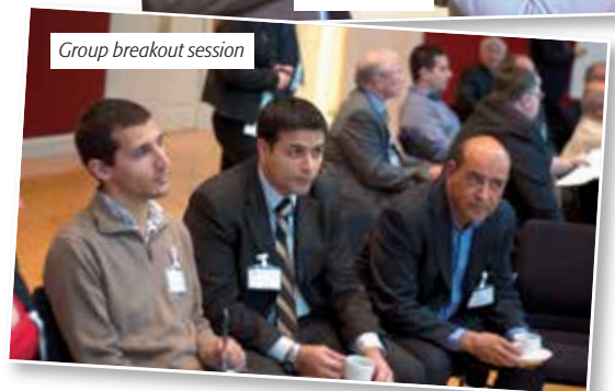
Group breakout session