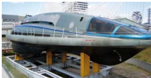
This 30-metre boat in Kobe is powered by a pair of superconducting electromagnetic motors.