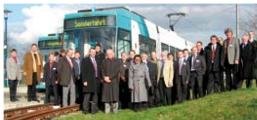
Above: Participants in front of the tram fitted with MITRAC Energy Storage. Right: Box with ultracapacitors on the roof of the tram.

After the theoretical discourse, participants got the