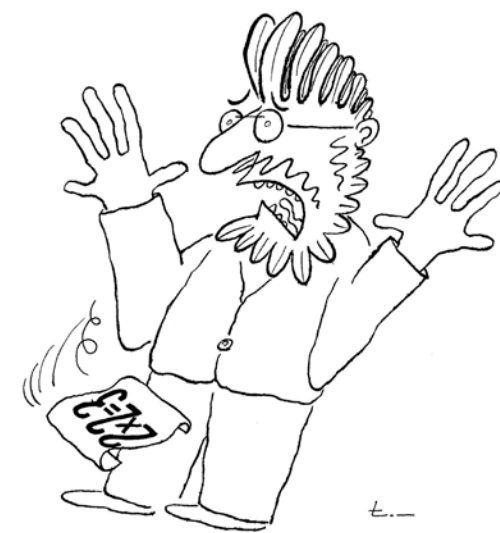
cartoon © Jeyan Arul