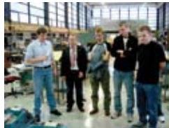
Above: The participation of our student branch members at the CRIS Workshop.