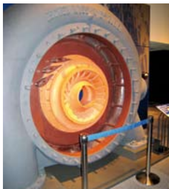
Electric power generator exposed – world-class exhibits at the Tokyo Electric Power Museum (TEPCO).

For more on the editor's visit to Japan, turn to page 4.