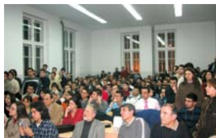
Below: The two lectures hosted by the Serbia-Montenegro Education Society Chapter and IEEE Student Branch Belgrade were open to the public and attracted more than 300 spectators.