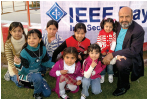
Members' families were invited to celebrate IEEE Day