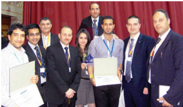
Region 8 representatives with students after the award ceremony