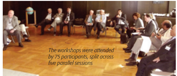
The workshops were attended by 75 participants, split across five parallel sessions