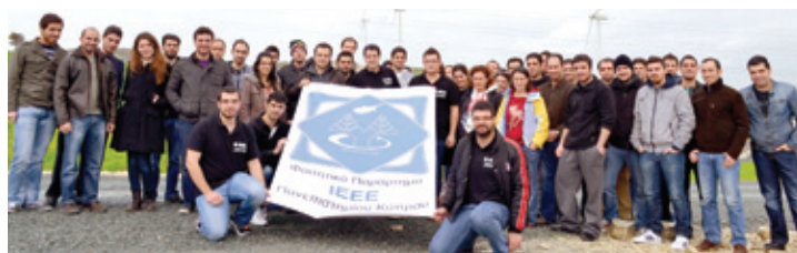
University of Cyprus Student Branch visiting a local wind farm

IEEE Arab Academy for Science & Technology Alexandria's Student Branch is proud to present its Student Professional Awareness Venture (SPAV): Leading Your Career, Leading Your Society.