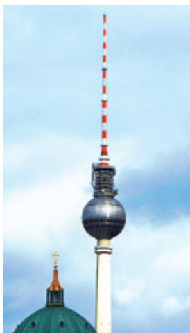
The Fernsehturm, Berlin's central TV tower, built in 1969, is the tallest structure in Germany