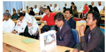
Caledonian College of Engineering, Muscat, Oman