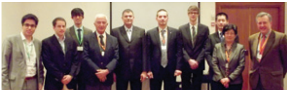
The contest finalists mingle with the jury