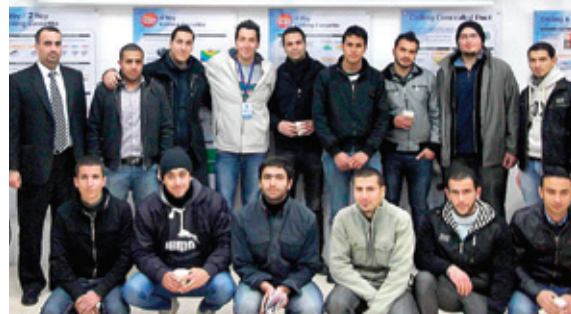
Students attending the three-hour course at LG AC Academy in Amman

HASHEMITE University Student Branch organised a trip to LG AC Academy in Amman on 4 March, where the students and members received a three-hour training session about LG Technologies in air conditioning systems. The AC Academy Administration also expressed an interest in organising a full-time training course in the future co-operation with the Student Branch.