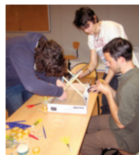
Engineering Students working on their Trebuchet Toss project