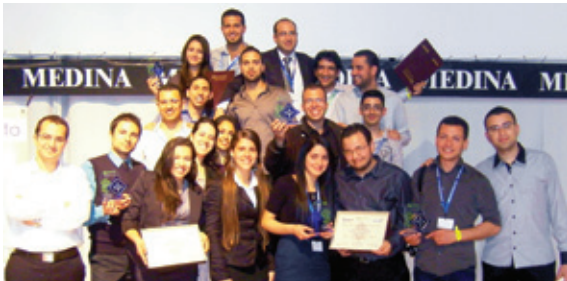
Student contest winners celebrate awards during the conference banquet