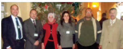
Members of the jury with two winners