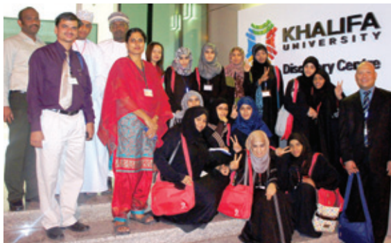
The complete delegation from the Sultanate of Oman to the 2nd GPC

Each competing team consisted of three students. During the gruelling competition, the teams tried to use a computer to solve ten problems in five hours. The team with the most number of problems solved correctly at the fastest time won. The problems included computer science and engineering applications such as data structures,