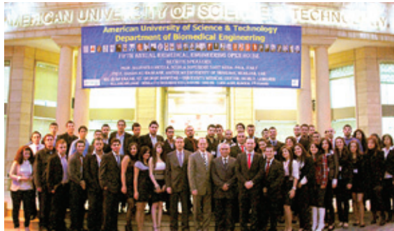
American University of Science & Technology (AUST), Beirut, Lebanon