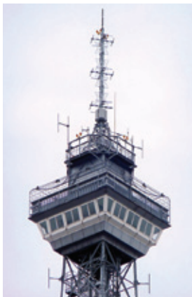
Berlin's Funkturm radio transmission tower, built in 1926, is now a protected monument

ON 31 March to 1 April, the 98th IEEE Region 8 Committee meeting took place in Berlin, Germany. Nearly 180 members attended the event and participated in the main meeting, workshops, subcommittee meetings and social events.