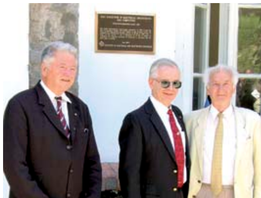
An IEEE Milestone plaque is unveiled in Vucje.