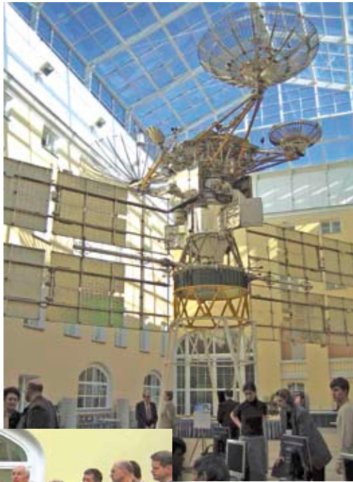
Above: Luch-15 stands proud in the atrium at the Museum of Communication.