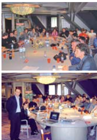
Above: Papers are presented and discussed at the conference.

IEEE Novi Sad Student Branch dumnic@uns.ns.ac.yu