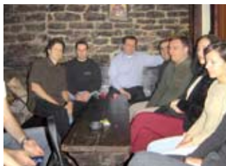
Below: Chilling out in a mountain cottage as part of the social activities.