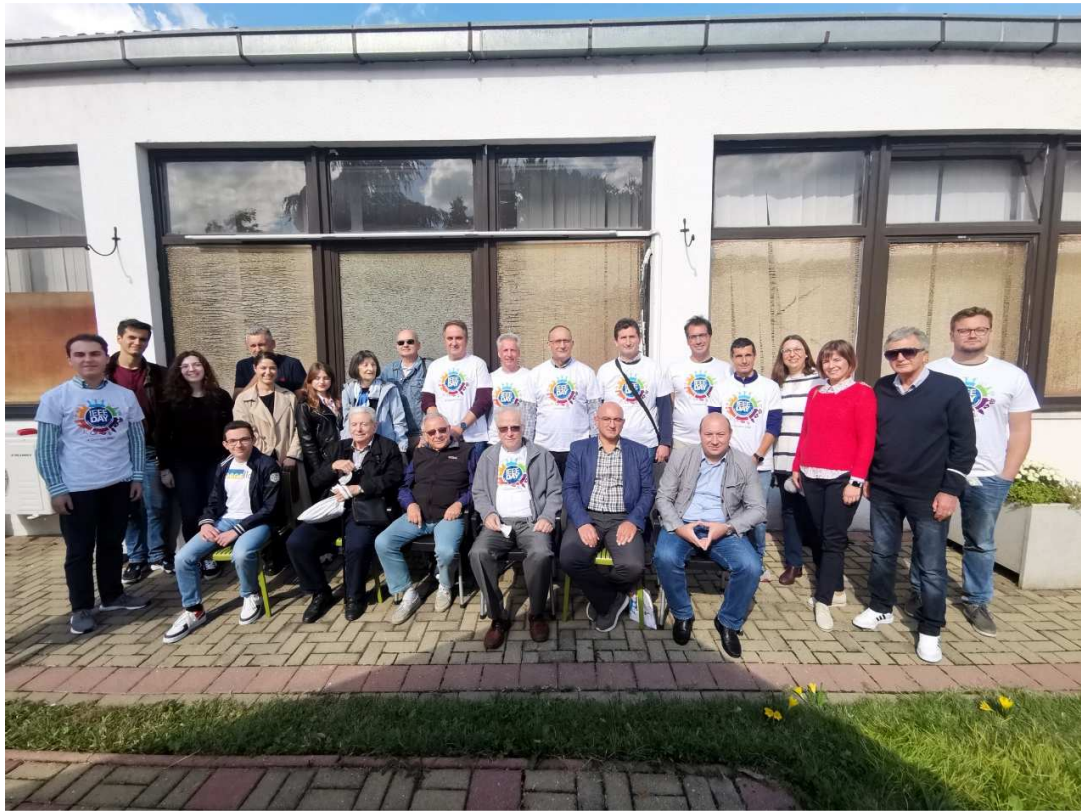
Fig 2 Group photo – IEEE Day 2022 (3 LM members sitting)