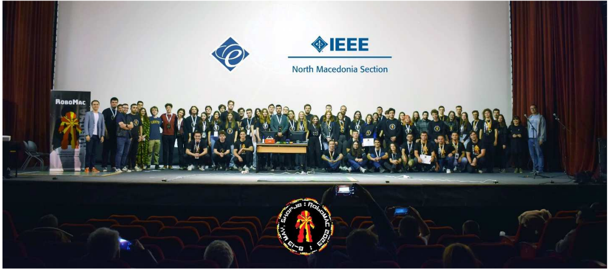
Fig. 4 RoboMac 2023 – Group Photo after the finals.