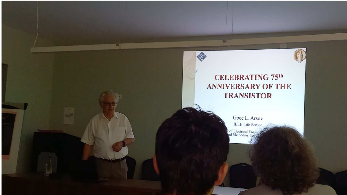
Fig. 1 LEOS 2022