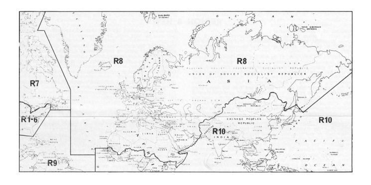
Figure 3. IEEE Regions as of 1 January 1970. The sketch is taken from IEEE Region 8 newsletter, No. 10, April 1970.

IEEE Region 8 was formed (as an IEEE Region after the IRE/AIEE merger) on 8 January 1963. At that time it comprised Europe, the Middle East and North Africa. The 'Rest of the World' was all Region 9 at that time, until in 1966, Region 9 was limited to South America and the 'Rest of the World' became Region 10, with Shigeo Shima as its first Director (1967-68). During its meeting on 13-14 November 1969, the Board of Directors agreed to change Bylaw 401.1 such that 'Region 8 shall consist of Greenland, Europe, U.S.S.R. and the following countries in North Africa and the Near East: Aden Protectorate, Algeria, Bahrain, Chad, Eritrea, Ethiopia, Iran, Iraq, Israel, Jordan, Kuwait, Lebanon, Libya, Mali, Mauritania, Morocco, Muscat, Oman, Niger, Qatar, Saudi Arabia, Somalia, Spanish Sahara, Sudan, Syria, Trucial Coast, Tunisia, Turkey, the United Arab Republic, and Yemen.' See Fig. 3. Note that 'United Arab Republic' was at that time and until 1971 the official name for Egypt; between 1958 and 1961, it was the name of a union between Egypt and Syria.