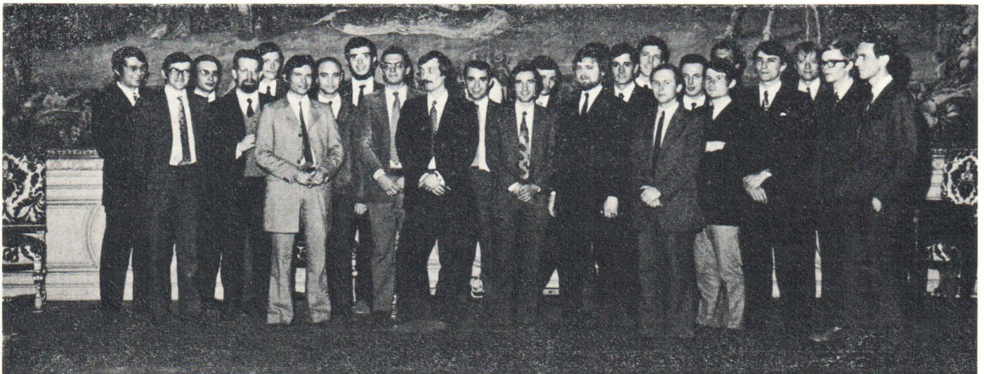
Participants in the Region 8 Student Contest with students from the Ecole Supérieure d'Ingenieurs d'Electrotechnique et d'Electronique at the reception held at the Chambre de Commerce et d'Industrie de Paris.

On 16 April the Ninth Region 8 Student Activities meeting was also held in Paris with participants from Benelux, Denmark,