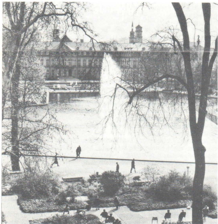
The so-called "New Castle" and part of the gardens in the city of Stuttgart, walking distance from the University where EUROCON 80 will take place.

The following are among the many other speakers and topics of particular interest: