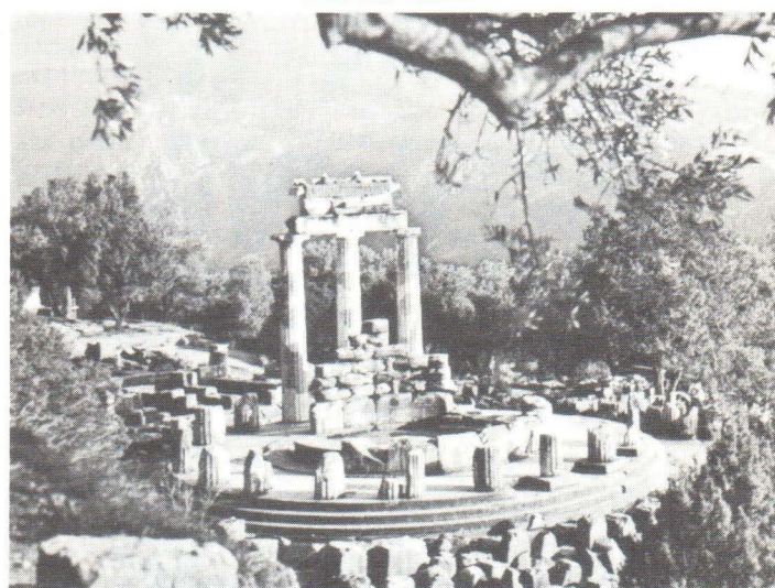
The 'Tholos' of Marmaria, Delphi - the seat of the Oracle of ancient times.

Special arrangements and participation at a reduced price will be provided for students.