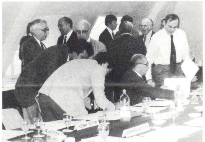
Region 8 Committee in informal session in Versailles.

The Region 8 Committee has been aware for some time of the advantages to be gained by providing more opportunities for the Director-in-office to pass on his information and experience to his successor. Discussion took place both on an earlier suggestion that the nominations for Director be brought forward by a year with the present electoral procedure remaining unchanged as well as on a new proposal for the creation of an office of Director-Elect who would be elected by the members and become a member of the Region 8 Committee for one year before automatically assuming a two year office as Director.