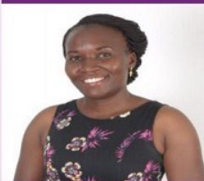
MEMBER | KENYA