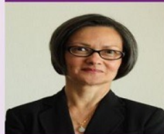
CORRESPONDING MEMBER, EX OFFICIO : IEEE WIE COMMITTEE