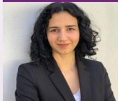
MEMBER | PORTUGAL