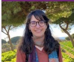
PAST-CHAIR | GERMANY