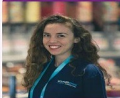
CORRESPONDING MEMBER | GREECE