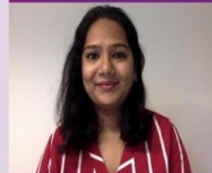
CORRESPONDING MEMBER, EX OFFICIO : IEEE WIE COMMITTEE