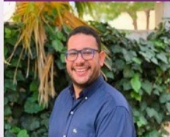
CORRESPONDING MEMBER, EX OFFICIO: R8 YPs | Tunisia