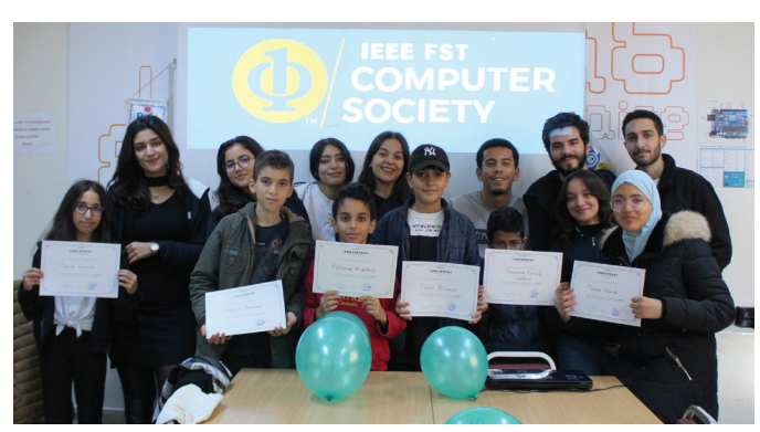
Codakids STEM workshop

Python programming. Designed for beginners and led by experienced programmers, the workshop covered the basics of programming, including data types, variables, and more. By the end of the workshop, CS members have gained a strong foundation in Python programming and the skills to start building their own projects and participate in coding competitions.