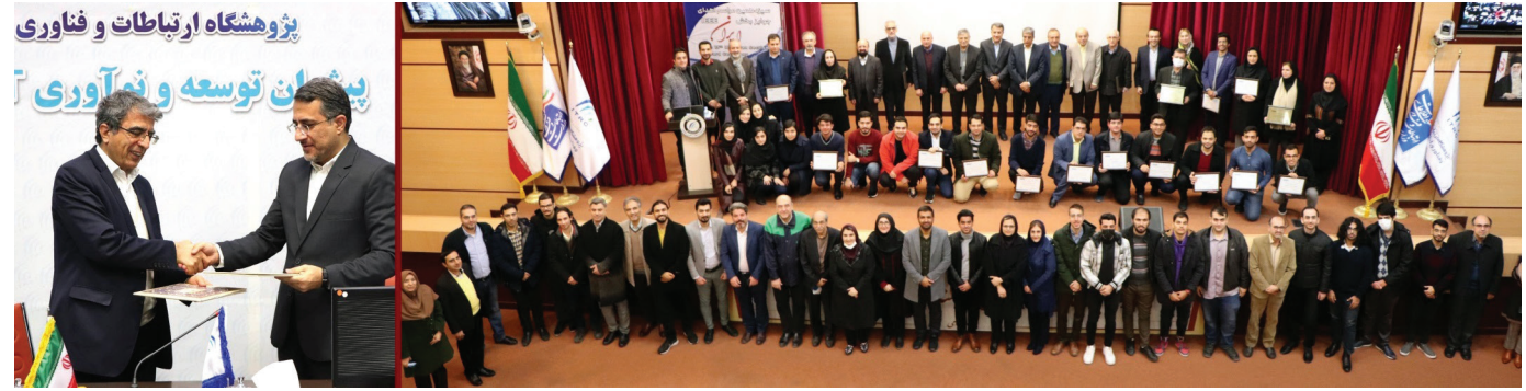
Signing MoU with ICT Research Institute (left) and awards ceremony (right)

The IEEE Iran Section, with a history of over half a century, comprises 17 committees, 6 technical societies, 58 student branches, consultants and industry experts.