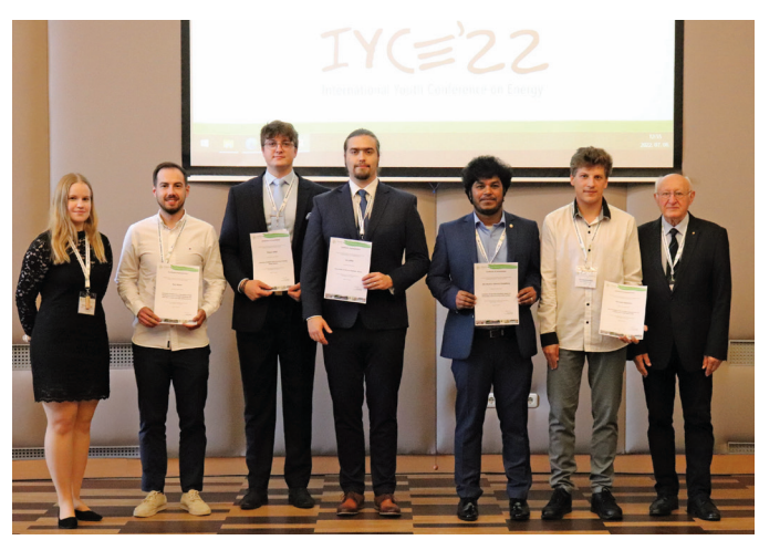
IYCE'22 Technical Session award presentation

The envisioned cooperation may include administrative and technical help in setting-up LMAG meetings, endorsing nominations and technical programs, providing meeting speakers and organizing joint events. In that line, various activities have been reported by the LMAGs of the Sections Czechoslovakia, Greece, Hungary, North-Macedonia, and the United Kingdom & Republic Ireland, in conjunction with the local and Section-related events. Further initiatives on the regional level are mentioned below. These ideas have been well promoted by the Team and Vice Chair of R8 Member Activities.